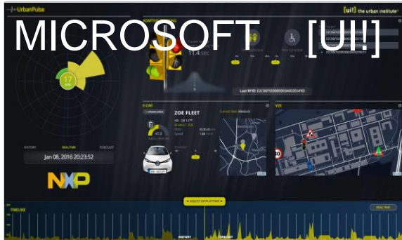
SMART CITY MGMT SECURE UNMANNED AERIAL VEHICLES